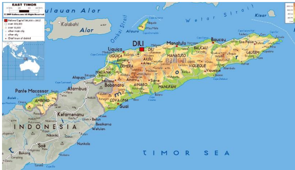
The Locality of the OACPS Research and Innovation Program in Dili, Timor-Leste.

The Government of Timor Leste, through the Instituto Nacional de Ciências e Tecnologia (INCT), has requested the support of the OACPS Secretariat to enhance its research and innovation (R&I) system and strengthen the cooperation between its key actors.