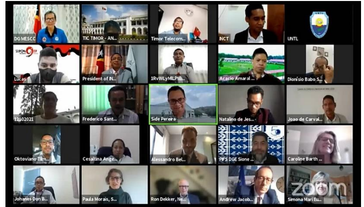
Methodology: The virtual kick-off meeting

Results of the OACPS Research and Innovation Programmer: to increasing collaboration between its key R&I actors (government, higher education institutes, industry, and civil society).